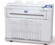
Digital Copier/Printer with Scan-to-File/Net